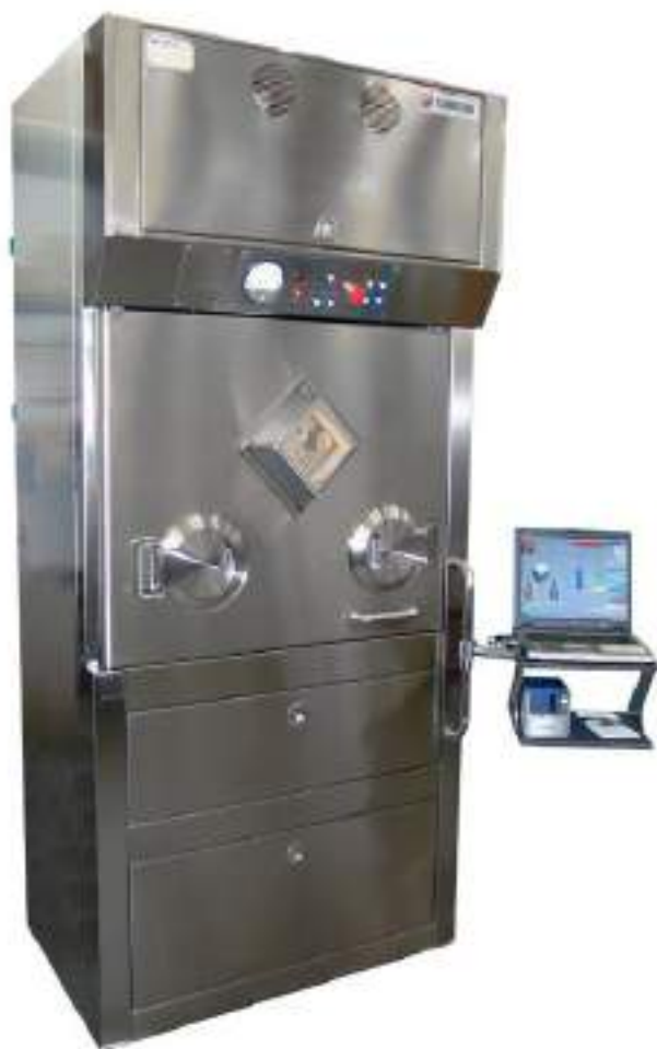
One of the Comecer's machines, using an HMI workstation based on MoviconX

The automation technology adopted by Comecer is based on fieldbus, PLC Siemens