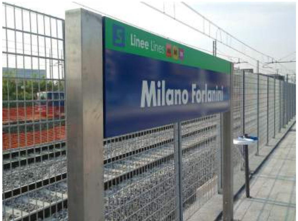
1. Forlanini Station in Milan

The electronic panels of the lifts have been equipped with a control unit that interfaces with an external system to notify ongoing lift operation states: floor number, door closed/opened, Alarm block, smoke detected, presence and non-presence of people in lift, and going up or down. Commands can also be activated for maintenance and emergency purposes. Decentralized peripheral devices have been installed inside the