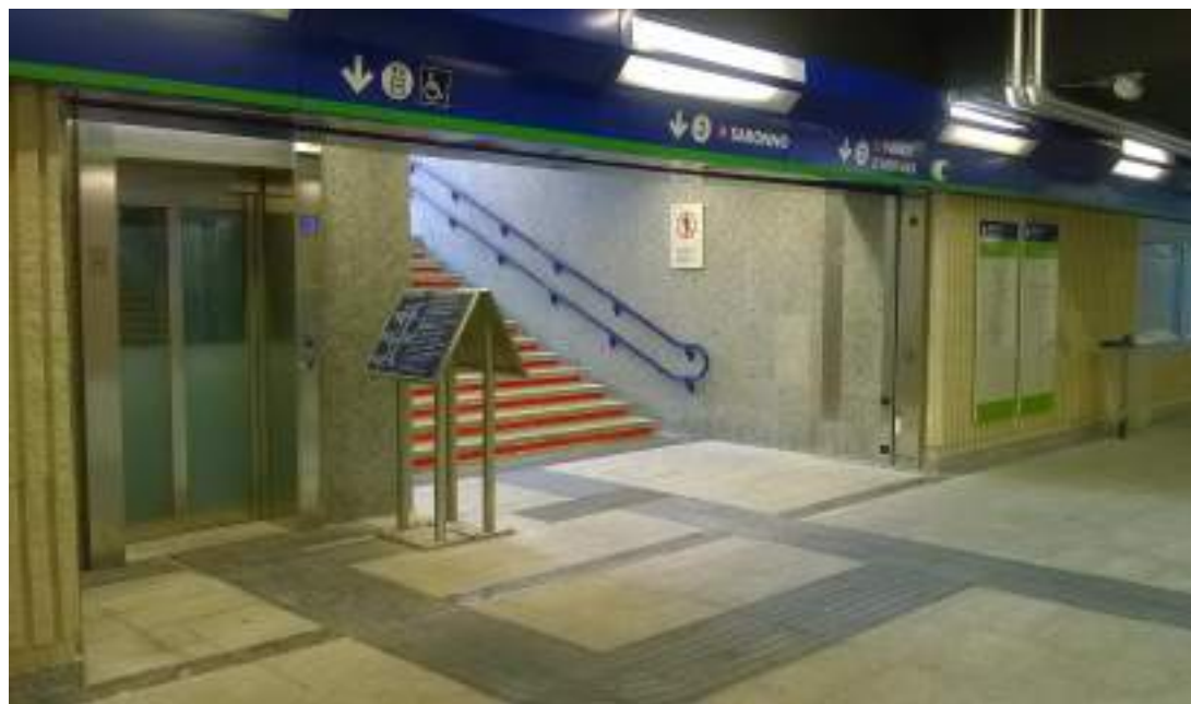
2. Underground station level

Operators had to be able to obtain information, modify statuses and reset subsystem conditions by using userfriendly menus and screens. The SCADA had to manage the variables from the installed local device meters of each lift (no. of lift movements, etc) in real-time by collecting and displaying the information on purpose-built screens for inspection and recorded on Historical Log simultaneously. The screens had to be printable on demand and show histograms. All system data had to be automatically recorded on file daily for examination or printed when needed in order to perform comparisons with previously recorded data in specific time ranges of one or more days. Furthermore the system had to record on log files, all the events that occurred in each lift device and all the operations performed by the operators, such as: login with