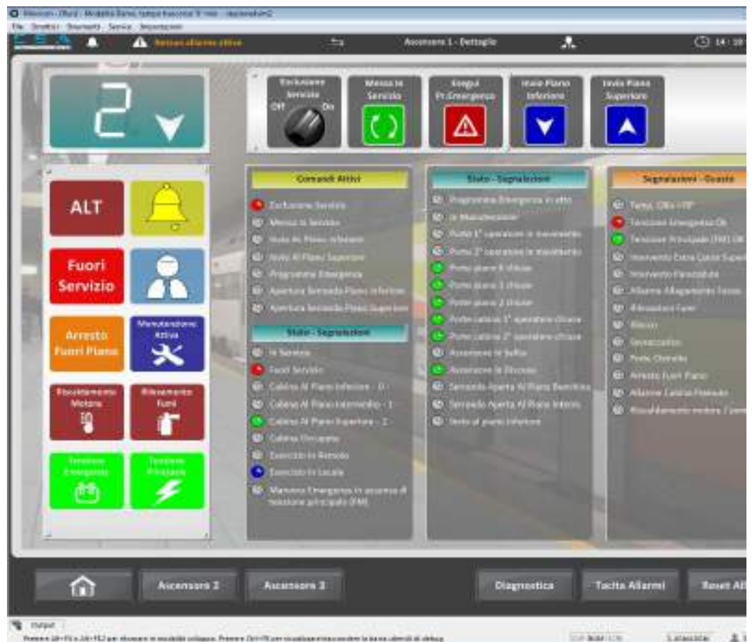
4. A detailed Movicon screen page of lift 1 showing all the settable parameters

specific client demands. In order to satisfy these demands in the best way possible it was often necessary to use script. However the result of doing so did not always meet the expectations envisaged. In fact the results obtained were less than satisfactory and often took a long time to develop. Based on the client’s objectives that were set out in the contract specifications and the ten year know-how of the Movicon SCADA system, CEA was able to completely develop an application solution that included all the requested features. In addition they were able to deliver it before the station opened to coincide with the inauguration of the Expo in Milan on the 1 st May 2015. The features which have been used