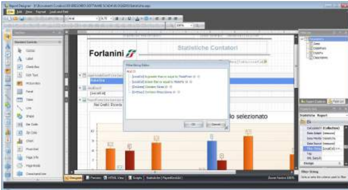
6. Report Designer screen with Filter String Editor feature

Movicon structure prototypes it was possible to create variables groups with member structures for each lift. Therefore the operator