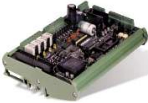
I/O modules distributed on buses made by PICOdata

The physical level is composed of remote I/O devices purposely designed and produced by PICOdata for simplifying and making generic electric wiring and cable connections, up to a distance of 8km, more cost effective. The BOSS-4 devices used have 4 opto-isolated inputs for monitoring, 4 outputs in micronetwork for controlling and a built-in Motorola 68HC11 to slim down communications with the central supervisory unit.