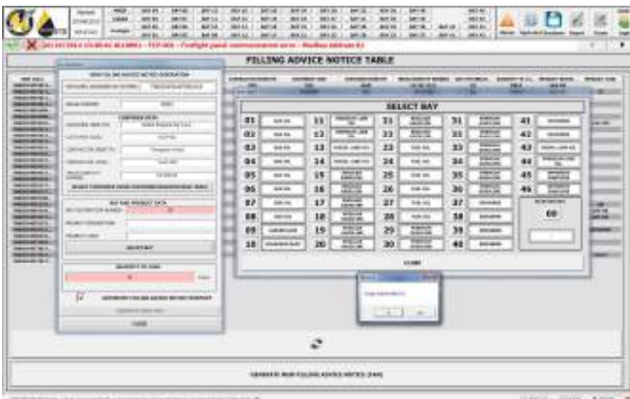
3. An example of a Bay assignment for generating new filling advice notices