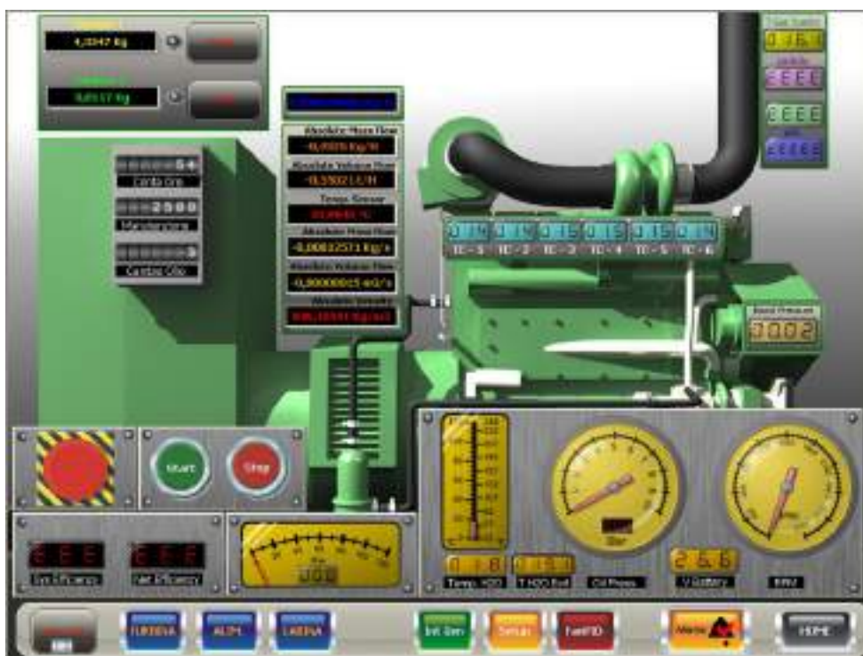
A graphical screen page from the Movicon supervision system. The supervisory system at the production center contains clear and intuitive visualization of all the working parameters.

does not need additional costs. The electric energy produced, can be fed into the power grid to profit on the all inclusive fifteen year incentive tariffs or alternatively using the green certificate scheme based on plant size and biomass type used. A very small part of thermal energy is used for the plant's vital cycle process whereas the remaining part can be used in civil or industrial heating systems or in any other application that requires conventional heating obtained from water heated to about 80 °C.