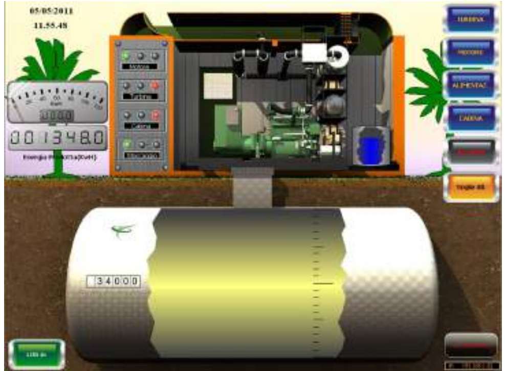
By means using the supervision system the user can manage and control the system both locally and over the internet, thanks to the Movicon Web Client technology.

with provisions for Supervision and Control room use, screen graphics representing the different working areas are used for user interfacing the plant system to control, monitor all situations and obtaining reports on energy produced and