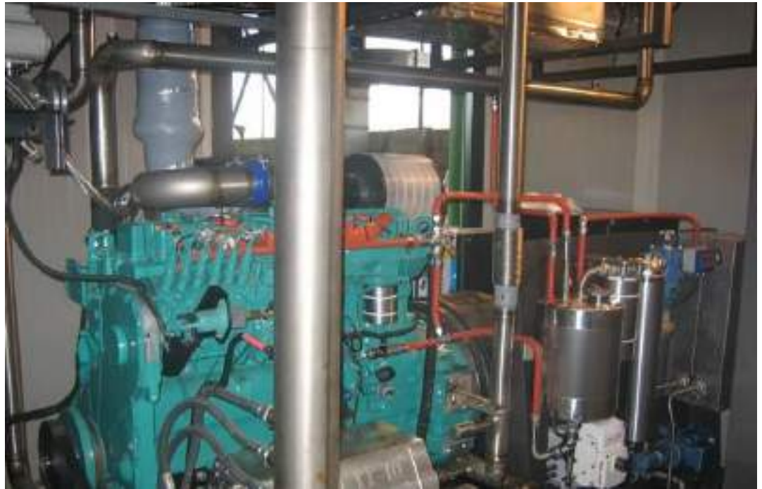
Inside the cabin of a 100 kW electric-thermal energy production generator designed by Powertron. The system works on an average of 650 hours/month continuously.

The UE State members have self imposed this as their "20/20/20 target" as part of the European 2020 strategy, promoting incentives for sustainable energy produced from renewable sources. In Italy in narrowing the field to power plants fueled by biomass and specifically vegetable oils, the Ministerial Decree of 18 th December 2008, subsequently amended by