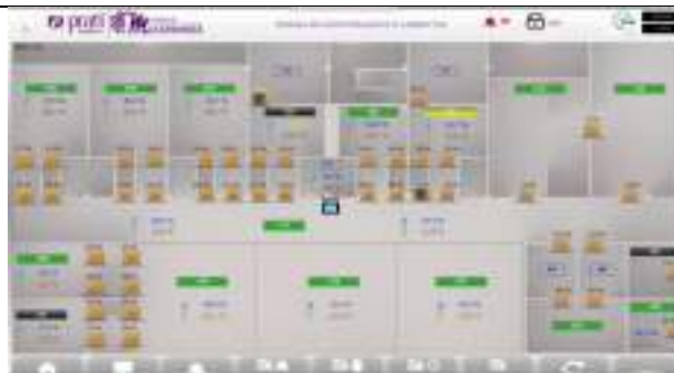
Some of the many Movicon supervisory graphical screen pages through which operators can monitor and control the various systems and EMS

The purified water loops are used in the production process to distribute the water to different drug production points in the factory. Each distribution PW loop consists of a storage tank where two pumps work in parallel and alternate to ensure that pressure is kept at a safe level throughout the loop. The pumps are equipped with a frequency inverter that is controlled by a pressure probe and flow meter to permit pressure continuity independently from the number of user points opened.