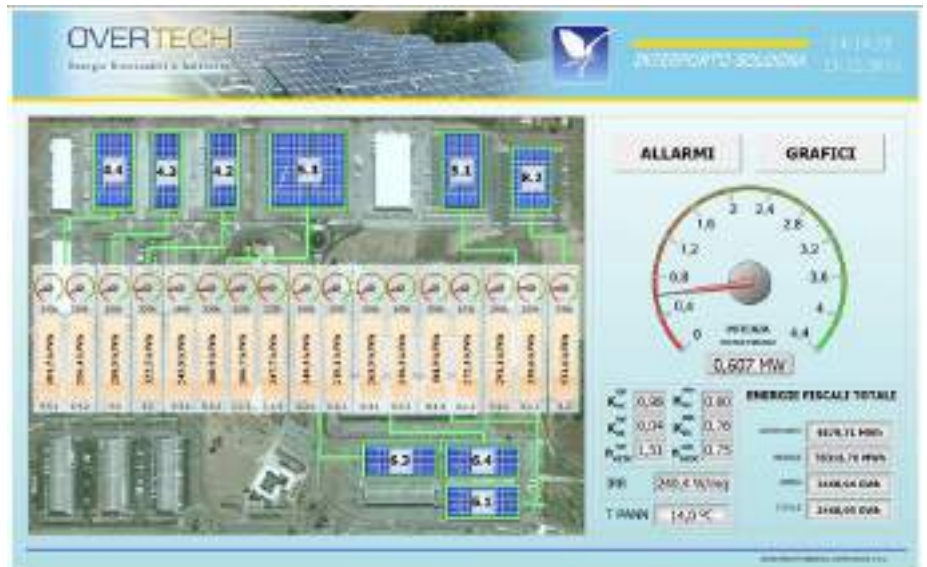
Main supervision screen showing all of the Bologna Freight Village's photovoltaic system based on the Movicon 11 Scada technology.