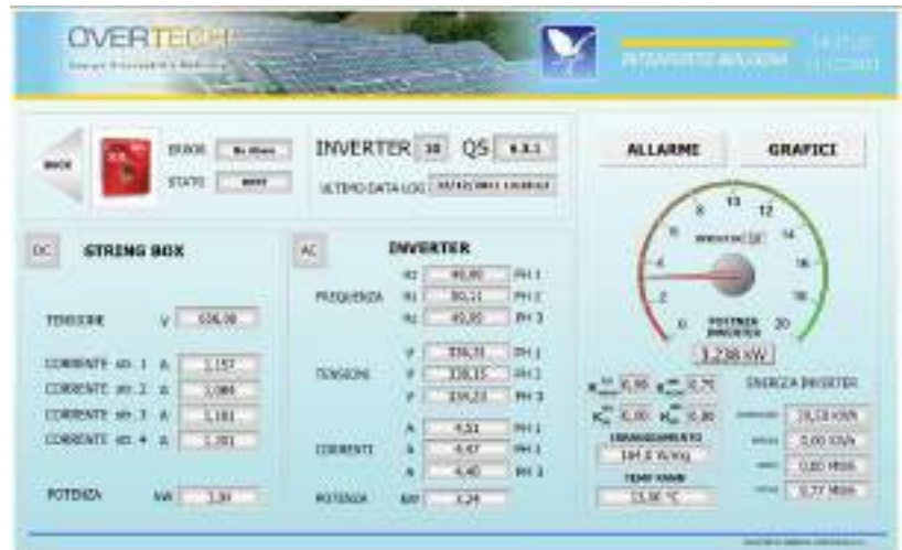
The Movicon 11 user interface allows the user to get clear and intuitive vision and information of all the system's functionalities also accesible by web.

As explicitly requested by the company, access to the system is protected by Log In using password and username with assigned privileges based on job responsibility according to the security criteria.