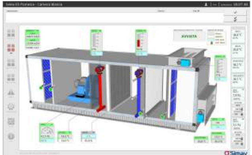
2. A Movicon screen dedicated to the Air Treatment Unit

The high quality standards required in this kind of application have led clients to create reports, archive and process a great volume of collected data using Movicon. To satisfy another need, the Alarm Dispatcher module has been implemented to optimize time of intervention in the event of system failure so that there is no need for the permanent presence of an operator. This module notifies maintenance workers if any alarm events occur in the system by sending sms alerts. The Progea software was chosen for its all-in-one and userfriendly SCADA interface with high definition graphics. It had all the features the client needed for all their systems and subsystems