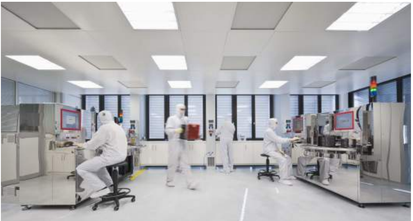
At work in the Cleanroom

which included Movicon tools such as the Variable Datalogger, the Report Designer to create reports and the Trend Data Analysis. In addition to having a simple and intuitive interface, Movicon has responded correctly to the need for one SCADA to reliably communicate with the PLC S7-1500 using easy-to-configure drivers and with the field using Modbus