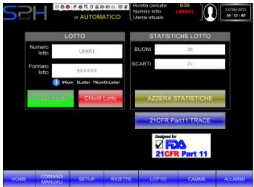
2. CFR 21 Part 11 screen with Trace button

The architecture is composed of a HMI panel installed with the Movicon 11.4 supervision software that interfaces with the PLC, the inkjet printer, telecamera control display system and drives with absolute encoders. The advantage gained from using the PLC display system and the Omron drive is that they both communicate with the EtherCat natively.