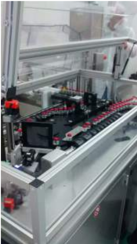
1. Bottle cap sealing machine

perfectly aligns to the functional needs throughout the project development phase.