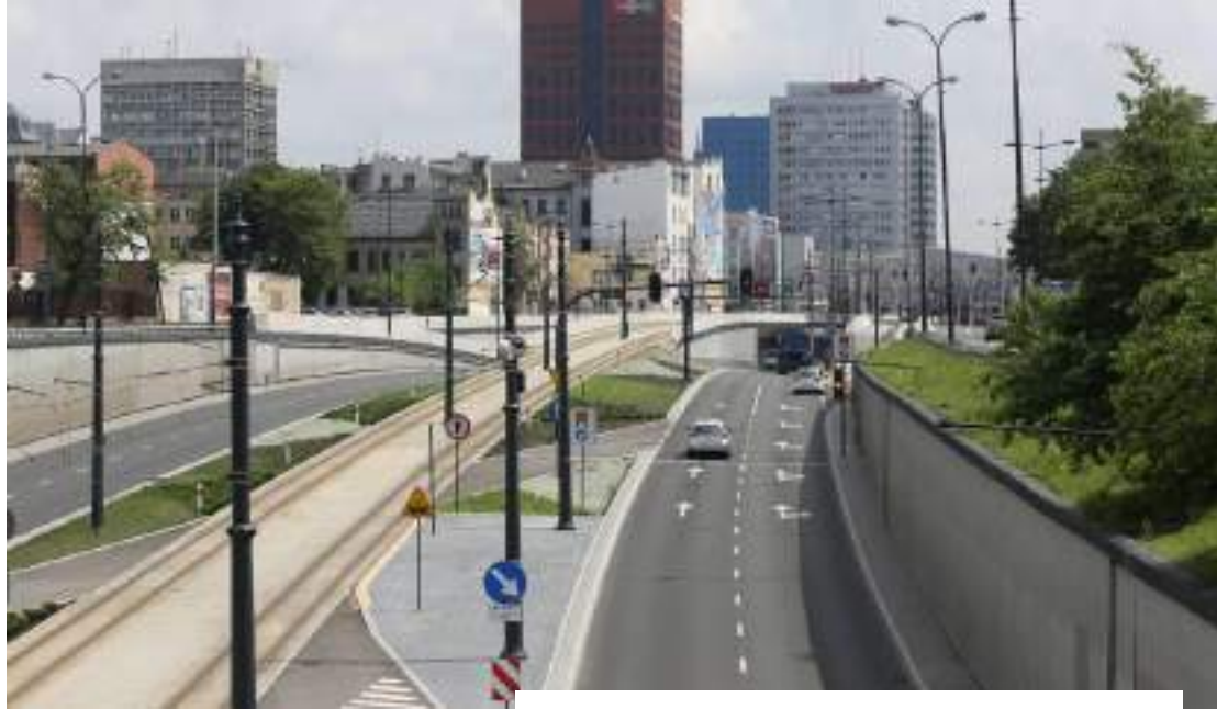
The Lodz city tunnel (Poland) is fundamental for transport travelling across a city of 700,000 inhabitants.

The Lodz City Council's core mission is to manage the important infrastructure by assigning work and surveying its implementation according to the terms of the project and under the jurisdiction of the law,. The Lodz City Council is an organizational unit of the city of Lodz, whose main objective is to provide assistance to the city's Mayor, in order to ensure that provisions are properly implemented and that all the tasks and objectives undertaken by the city are carried out in accordance with the law.