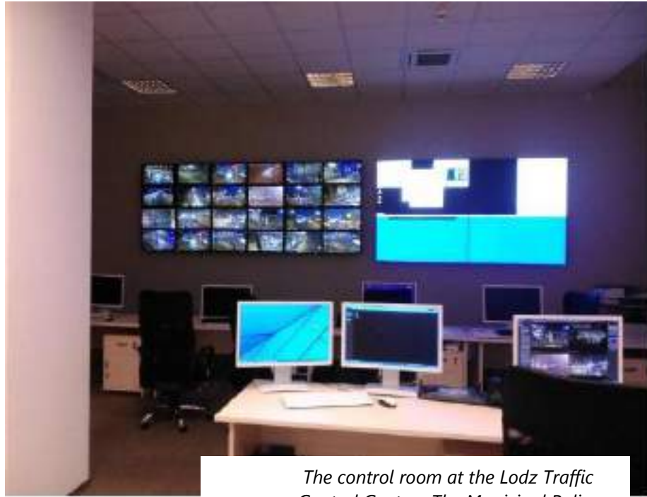
The control room at the Lodz Traffic Control Centre. The Municipal Police offices are also connected to the system.

The project completed with satisfactory results by fully complying to the client's demands both in terms of safety and efficiency. Thanks to the automatic controller logic, automatic traffic deviation control scenarios can be easily activated in real-time to provide road users with information by means of using VMS panels and Lane Control Signs to reduce the risk of serious accidents and traffic congestion.